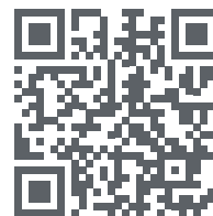
Revox Company Video

»We inspire our audiophile customers with STUDIO SOUND QUALITY products and our outstanding service«.