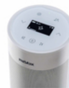
Display view A200