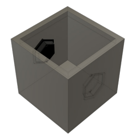
Botanic 50-2o Plant pot (50x50x50cm) with two Invisible Speakers opposite each other.