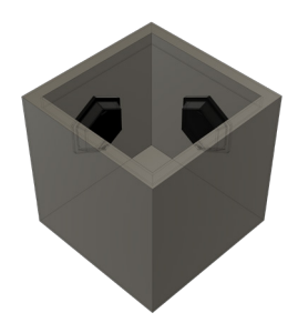
Botanic 50-2c Plant pot (50x50x50cm) with two Invisible Speakers across the corner.