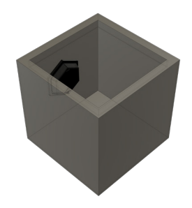
Botanic 50-1 Plant pot (50x50x50cm) with an Invisible Speaker on one side.