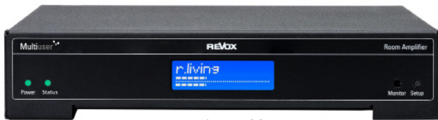
Front view M30

Thanks to its modular slot, the M30 can also be fitted with the optional I/O or I/O-HDMI module. The I/O or I/O-HDMI module offers 3 inputs (analog stereo, digital optical, I/O: digital coaxial, I/O-HDMI: HDMI ARC) and an analog output. The signal from the inputs can be distributed to all rooms of the Multiuser system. The analogue output with DSP equalizing is used for expansion with multi-channel amplifiers for very large rooms or high-performance amplifiers for power-intensive speakers. A wide range of control options via trigger IN/ OUT, IR input and C18 Wall Control make the M30 a universal talent.