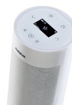
Display view A200